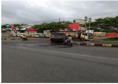
Figure 3. Locations prone to accidents on the KM19 Bypass Road in Padang City